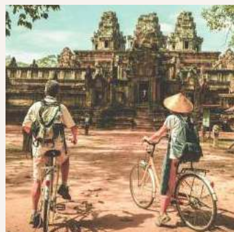
Angkor temple, Cambodia