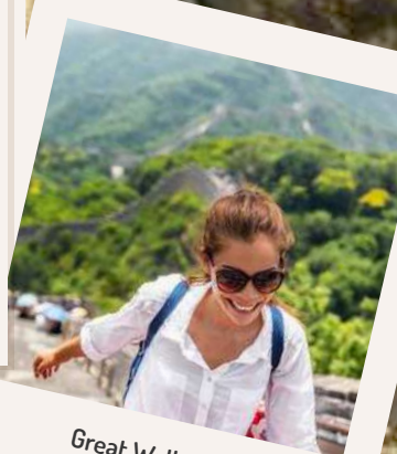
Great Wall, China