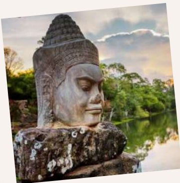
Stone face Asura, Cambodia