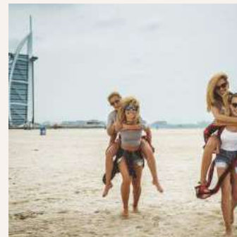
Summer Fun in Dubai!