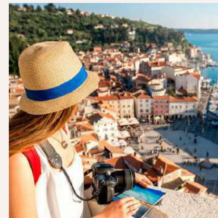
Perfect for Europe & Online