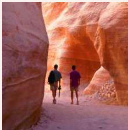
Perfect for Middle East