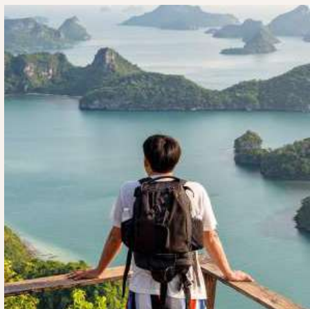
Perfect for Asia