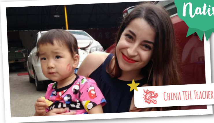
CHINA TEFL TEACHER

“Be brave, bold, and courageous but most of all, believe in yourself. If you don’t believe you can teach English, nobody will.