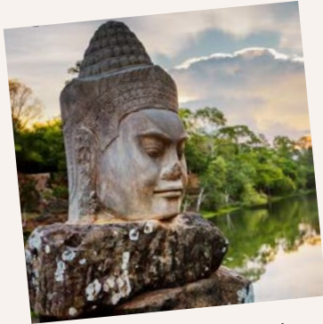
Stone face Asura, Cambodia