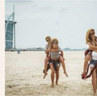
Summer Fun in Dubai!