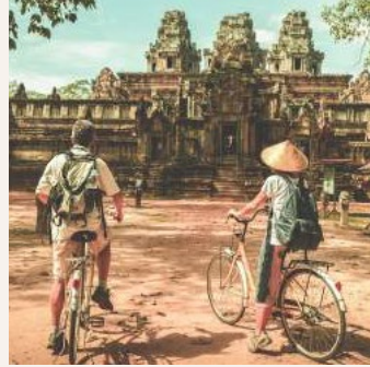
Angkor temple, Cambodia