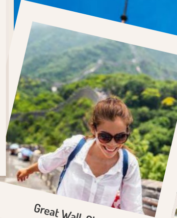
Great Wall, China