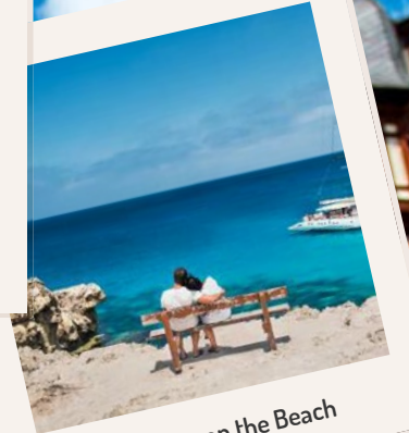
Relaxing on the Beach